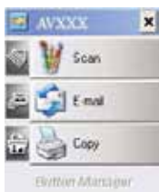
The Button Panel

1. After the Button Manager and the scanner driver have been successfully installed on your computer, the Button Panel will be displayed in the Windows System Tray at the bottom right corner of your computer screen.